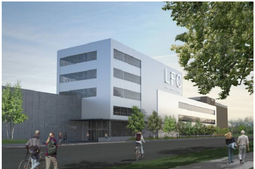
North Façade from Wilson